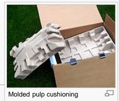
Molded pulp cushioning

The amount of shock transmitted by a particular cushioning material is largely dependent on the thickness of the cushion, the drop height, and the load bearing area of the cushion (static loading). A